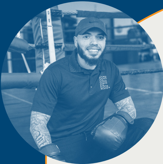
Dalton Outlaw Element Gym

WE BELIEVE IN THE POWER, DRIVE AND DARING OF LOCAL ENTREPRENEURS TO TRANSFORM LIVES AND REVITALIZE NEIGHBORHOODS