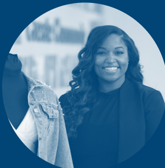
Lorraine Love LaNoire Bridal