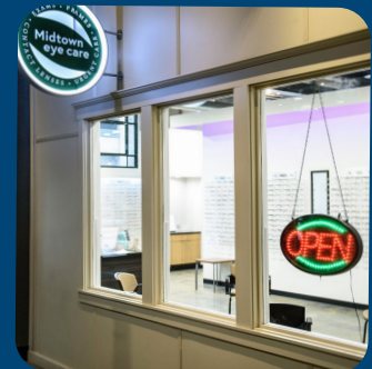
Akmed's new location in the Midtown Global Market