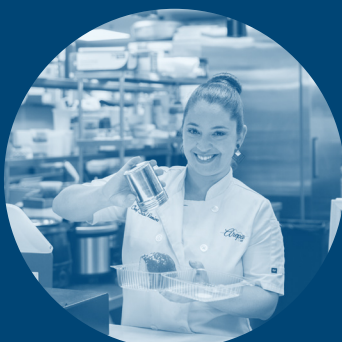
Soleil Ramirez Arepa Bar