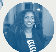
Ilka Bird Get Gorgeous Salon