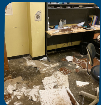
Akmed's previous location near Chicago and Lake